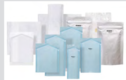
Sterilization Preparation / Autoclavable Pouches

Packaging solutions as uniquely designed as the devices you develop.