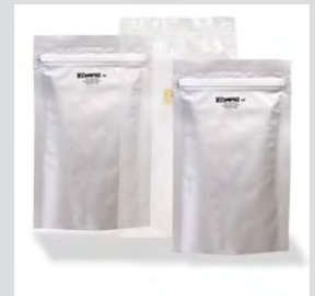
Zipper & Stand-Up Pouches